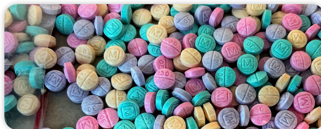
*FAKE rainbow oxycodone M30 tablets containing fentanyl